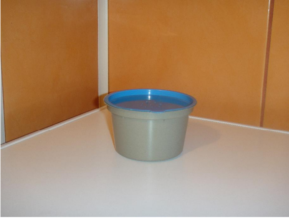
Package of polypropylene modified with composite

Final of the workpackage 2 : Preparation and characterization of the nanomaterials. Packages preparation.